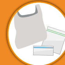
PLASTIC BAGS & STRETCHY PLASTIC