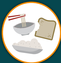
BREADS, NOODLES, RICE, BEANS & GRAINS