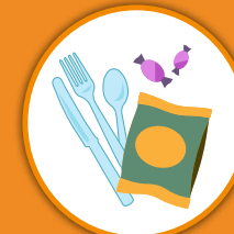
FOOD WRAPPERS & PLASTIC CUTLERY