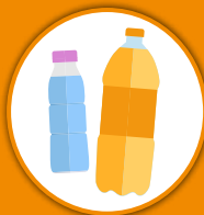
PLASTIC (INCLUDING MILK)