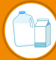
MILK JUGS & CARTONS