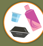
PLASTIC CONTAINERS & BOTTLES