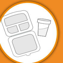
STYROFOAM CUPS & CONTAINERS