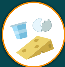
EGG SHELLS & DAIRY PRODUCTS