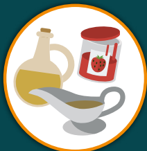
JAMS, SAUCES & SALAD DRESSINGS