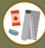
FOOD CANS & FOIL