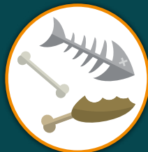
MEAT, FISH, SHELLFISH & BONES