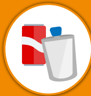
FOIL & ALUMINUM