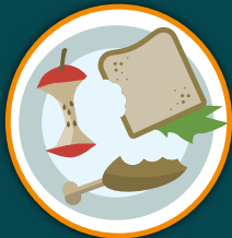
PLATE SCRAPINGS, UNFINISHED MEALS