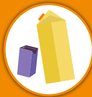
TETRA-BRIK (DRINK BOXES) & WAXED PAPERBOARD