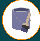
PAINT, SOLVENTS OR OTHER HAZARDOUS LIQUIDS

Drop off at the Transfer Site, 160 Hawk Avenue or bring to the Annual Hazardous Waste and Electronics Round-Up, watch online for event dates.