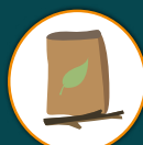
YARD & GARDEN WASTE

Drop off at the Transfer Site, or bring to the Annual Hazardous Waste and Electronics Round-Up, watch online for event dates.