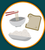
BREADS, NOODLES, RICE, BEANS & GRAINS