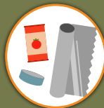
FOOD CANS & FOIL