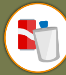
FOIL & ALUMINUM