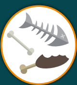
MEAT, FISH, SHELLFISH & BONES