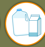
MILK JUGS & CARTONS