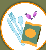
FOOD WRAPPERS & PLASTIC CUTLERY

REDUCE WHERE POSSIBLE. THESE ITEMS GO TO THE LANDFILL.