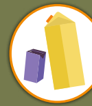
TETRA-BRIK (DRINK BOXES) & WAXED PAPERBOARD