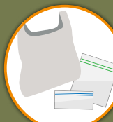
PLASTIC BAGS & STRETCHY PLASTIC