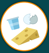
EGG SHELLS & DAIRY PRODUCTS