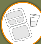
STYROFOAM CUPS & CONTAINERS