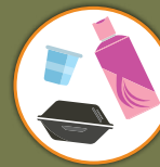
PLASTIC CONTAINERS & BOTTLES