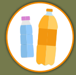
PLASTIC (INCLUDING MILK)