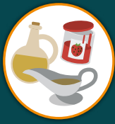
JAMS, SAUCES & SALAD DRESSINGS