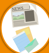
PAPER & NEWSPRINT